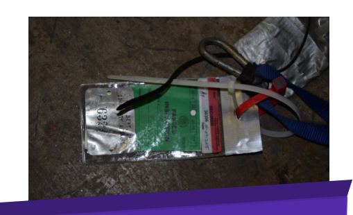
Green Tag and NJ ID