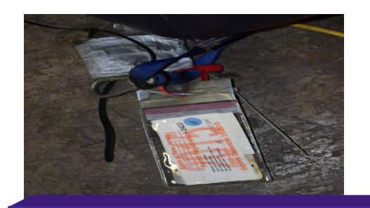
Current valid permit

Steps to Access Permitted Rides for a current calendar year: